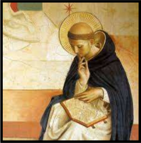
ST. DOMINIC PRAY FOR US

St. Dominic (1170 - 1221) Feast Day - August 4 th